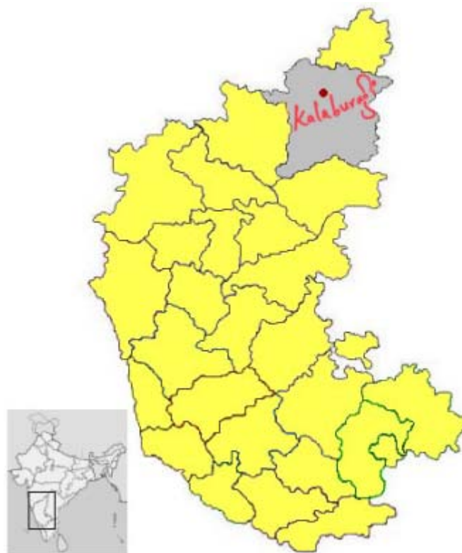
Figure 1. Study Area Kalaburagi

Participants were recruited from two maternity hospitals in Kalaburagi, one was Basaweshwar Teaching and General Hospital (Sedam road) and the other was Sangameshwar Hospital (Central Bus stop road). These hospitals were selected to study the possible traces of chemicals in lactating mother's milk. The present work was submitted and approved by the Integrity forming Committee of Mahadevappa Rampure Medical College, Kalaburagi (approval no. HKES/MRMCK/ IEC/ 20211107) and also the trial has been registered in