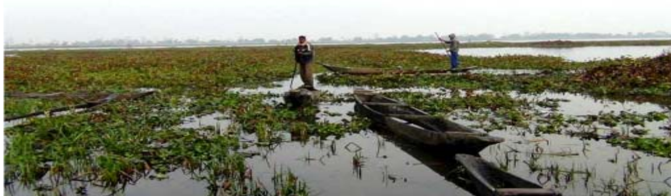
Figure 1. Overview of Borsola beel (wetland)

Gonadosomatic ratio or index (GSR or GSI): The gonadosomatic ratio or index has been used for estimating the development of gonad and spawning season of a species (Abujam and Biswas 2020). For estimation of GSR, the ratios were calculated month-wise and sex-wise as suggested by Nikolsky (1963),